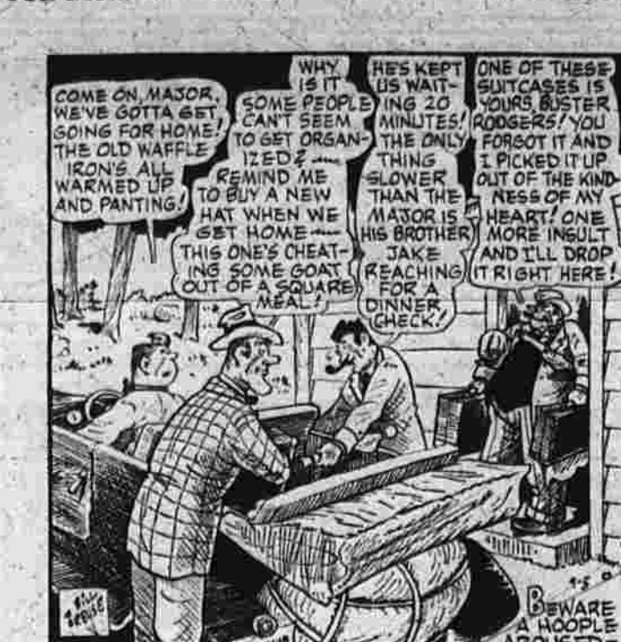
BY DICK TURNER