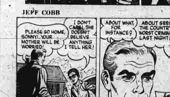
BY PETE HOFFMAN