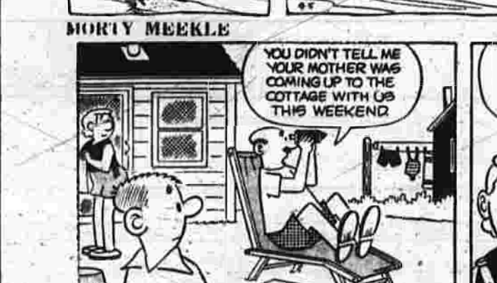
BY LESLIE TURNER