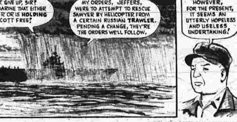
BY LANK LEONARD