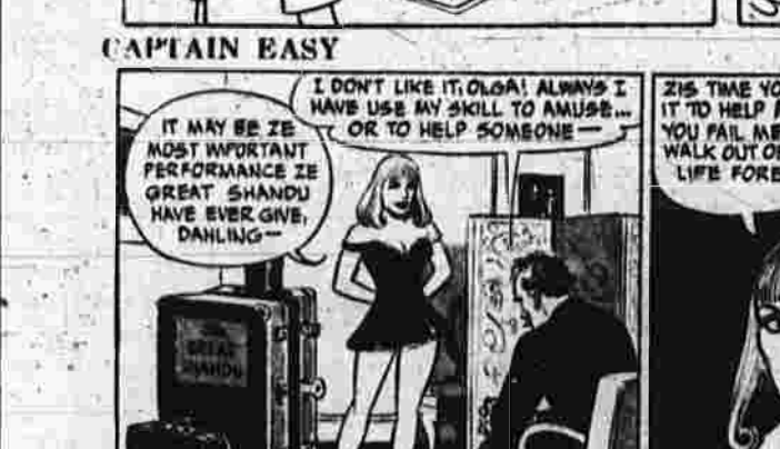
BY PETE HOFFMAN