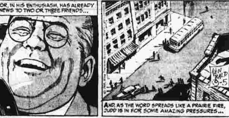
BY ROSS CRANE