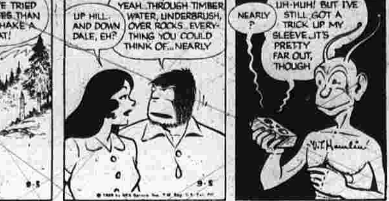
BY AL VERMEER